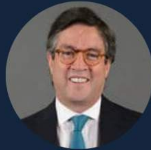
LUIS ALBERTO MORENO MANAGING DIRECTOR, ALLEN & CO | FORMER PRESIDENT, INTER- AMERICAN DEVELOPMENT BANK

In this morning session, the former president of an international development bank reflected on strategies to pull impoverished communities into economic prosperity and to address political instability and violence through development. The panelist highlighted five “keys” for these communities to move beyond emerging conflict. First, many of these conflicts are driven by a dependence on, and exploitation by, extractive industries. It is important to note, however, that extractive industries are not inherently problematic. Indeed, they can be sources for economic and