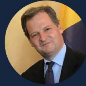
SERGIO JARAMILLO FORMER HIGH COMMISSIONER OF PEACE IN CHARGE OF NEGOTIATIONS | FORMER VICE MINISTER OF DEFENSE AND NATIONAL SECURITY ADVISOR OF COLOMBIA

In this morning session, two high-level negotiators from the Colombian Peace Process—Sergio Jaramillo from the Government of Colombian delegation and Marcos Calarcá from the FARC delegation—reflected on the factors and conditions that led to the signing of the 2016 “Final Agreement for the End of the Conflict and the Construction of Stable and Lasting Peace.” This agreement, which permanently and formally ended half a century of hostilities between the FARC guerrilla movement and the Colombian Government, resulted from over six years of negotiation, one-and-a-half of which were conducted entirely through a secret backchannel process that created the