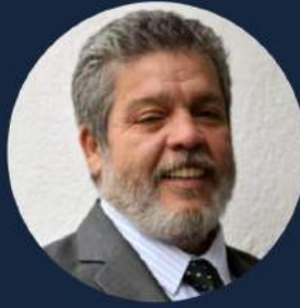
MARCOS CALARCÁ MEMBER OF THE COLOMBIAN HOUSE OF REPRESENTATIVES | FORMER FARC SPOKESPERSON