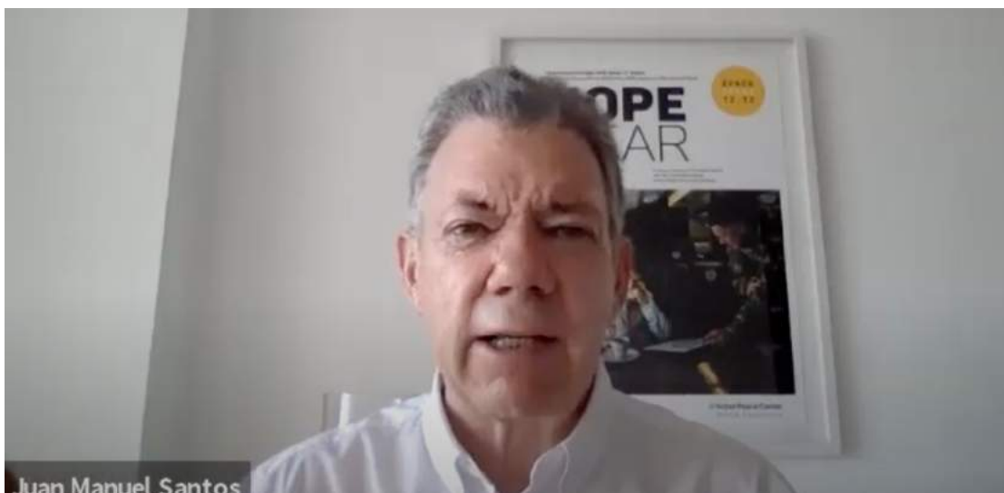
Juan Manuel Santos

to-day process. Second, Mr. Santos leveraged his military background and connections to bring Colombian military leaders into the process, convincing them that this process and the potential for peace was the product of their fighting, and bringing in two high-level generals to join the negotiating team. He later noted that having a military background is not a prerequisite for gaining the trust of the military, but that they must be brought into the process and respect it. Third, drawing on the importance of regional support for the success of the peace process, Mr. Santos was able to request leaders such as Hugo Chavez to call FARC leaders in order to nudge the process forward. Additionally, the presence of the US Special Envoy and Europe’s